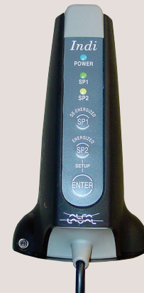
The indication unit IndiTop from Alfa Laval.