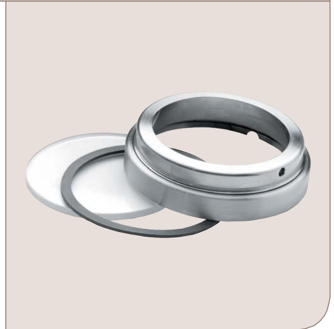
Fig.1. LKS 105, Tank sight glass.